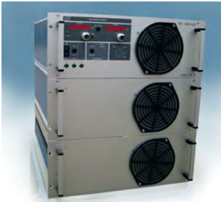
Design Example MCA 9000 - 1500 1500V / 18A, max. 9000W

Series NCA / MCA from 55 V to 3000 V / 750 W to 9000 W