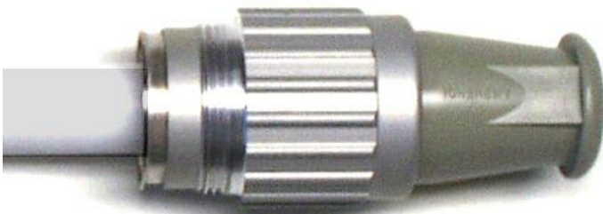
S 150, HVS 65, HVS 100, HVS 150 (Difference only in length)