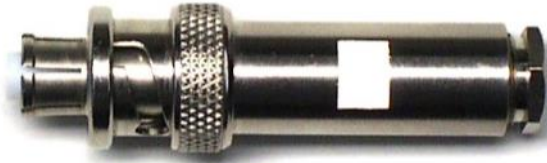
SHV- cable jack